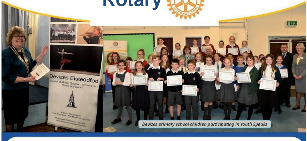
Devizes primary school children participating in Youth Speaks