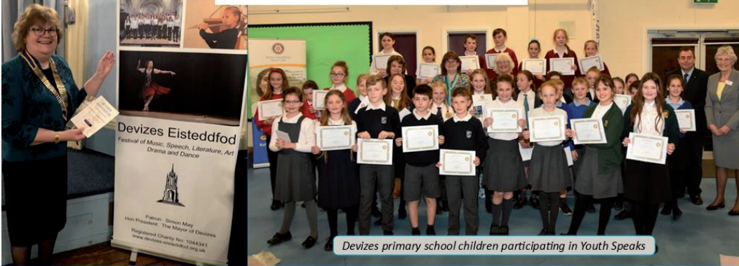
Devizes primary school children participating in Youth Speaks